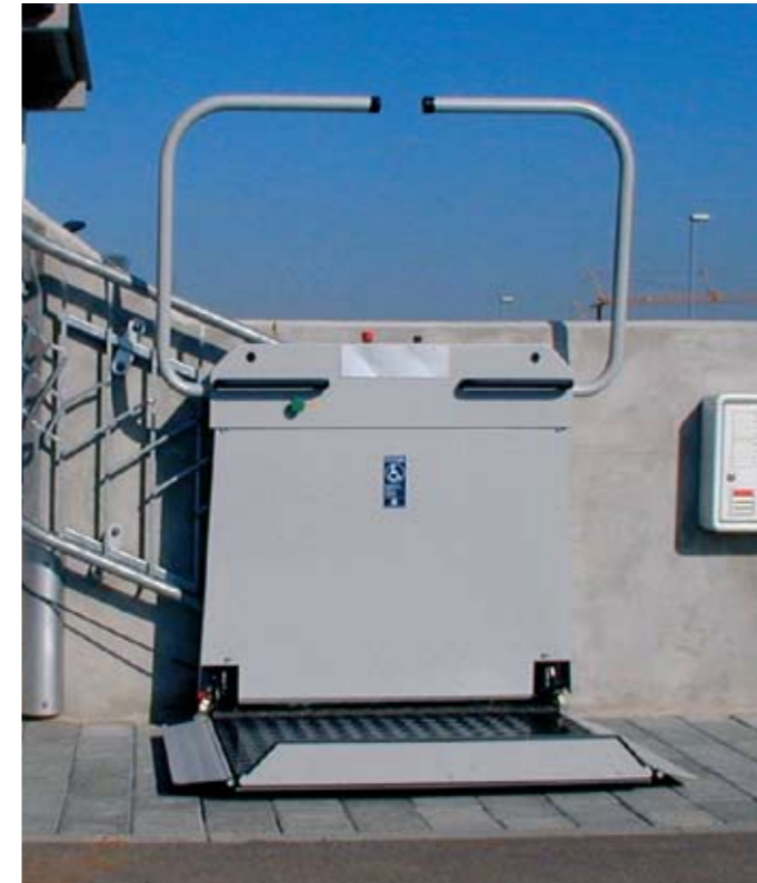
Outdoor Stairlift System for wheelchair

The freeSTAIR for wheelchair has been designed to enable wheelchair users to move with autonomy, safety and comfort and access any building where the installation or use of a conventional lift is not possible. The systems can be installed in both indoor and outdoor spaces, mounted either on the wall or on floor stanchion. The ideal solution for public and private spaces alike.