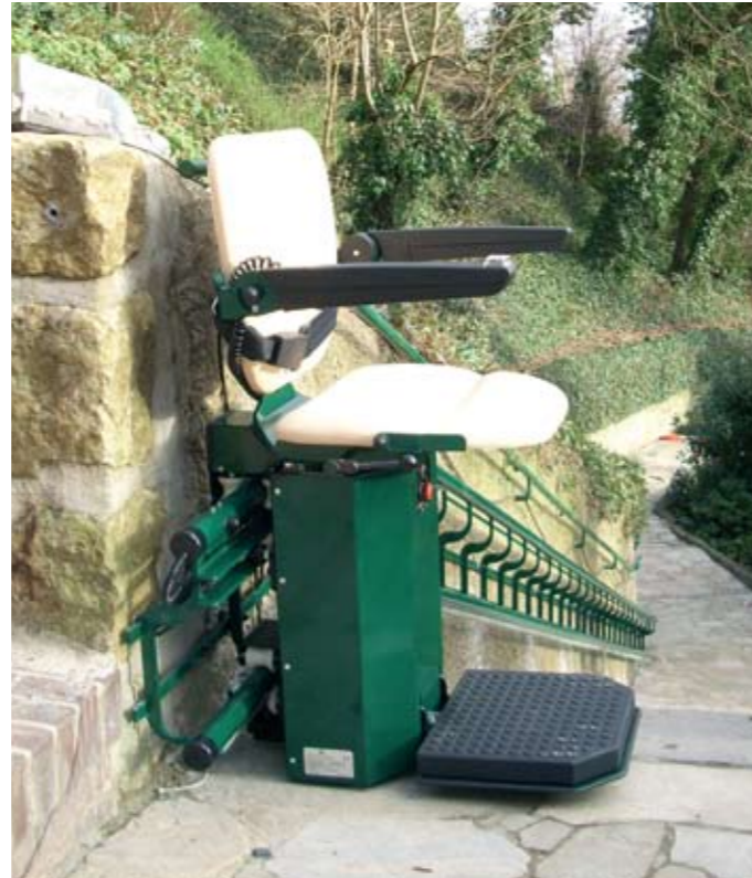
Outdoor Stairlift System with chair