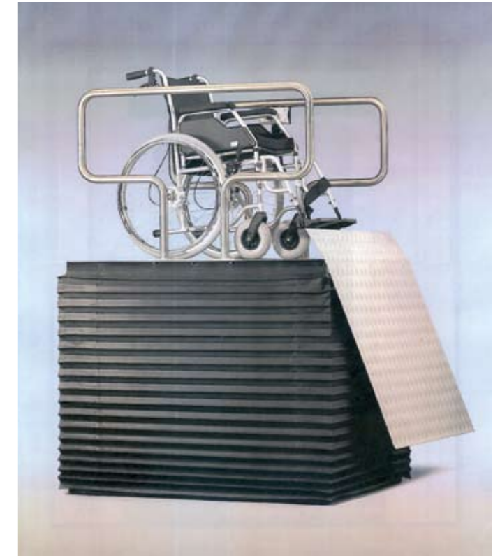
Stairlift System for wheelchair with scissor-type mechanism