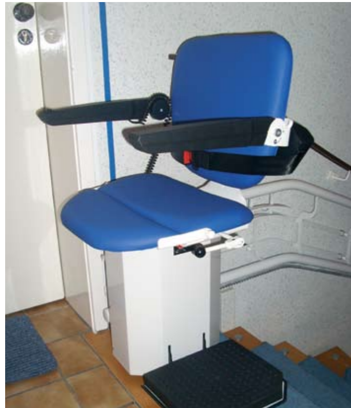
Indoor Stairlift System with chair

The freeSTAIR system with chair has been specially designed to help persons of all ages who have difficulty climbing stairs. The systems can be fitted to any staircase, whether indoor or outdoor, as they are custom-made for each individual application. FreeSTAIR can be installed in homes with both straight or curved staircases, and where the installation of a Maisonlift is impossible. Kleemann FREEstair is available in a number of different types, one of which is certain to meet the needs of any user.